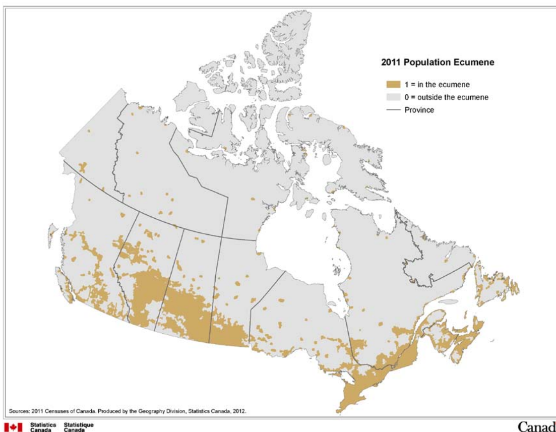
Figure 3.1 Example of an ecumene mask with the provinces and territories generalized cartographic boundary file

In choropleth map applications, one of the inherent limitations is that the statistical distribution is assumed to be homogeneous or uniformly spread over each geographic area, and is consequently represented by a single tone or colour covering the entire area. Using an ecumene limits the display to only those areas where population is found and results in a more accurate representation of the spatial distribution of data.